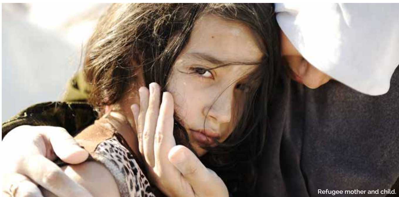
Refugee mother and child.