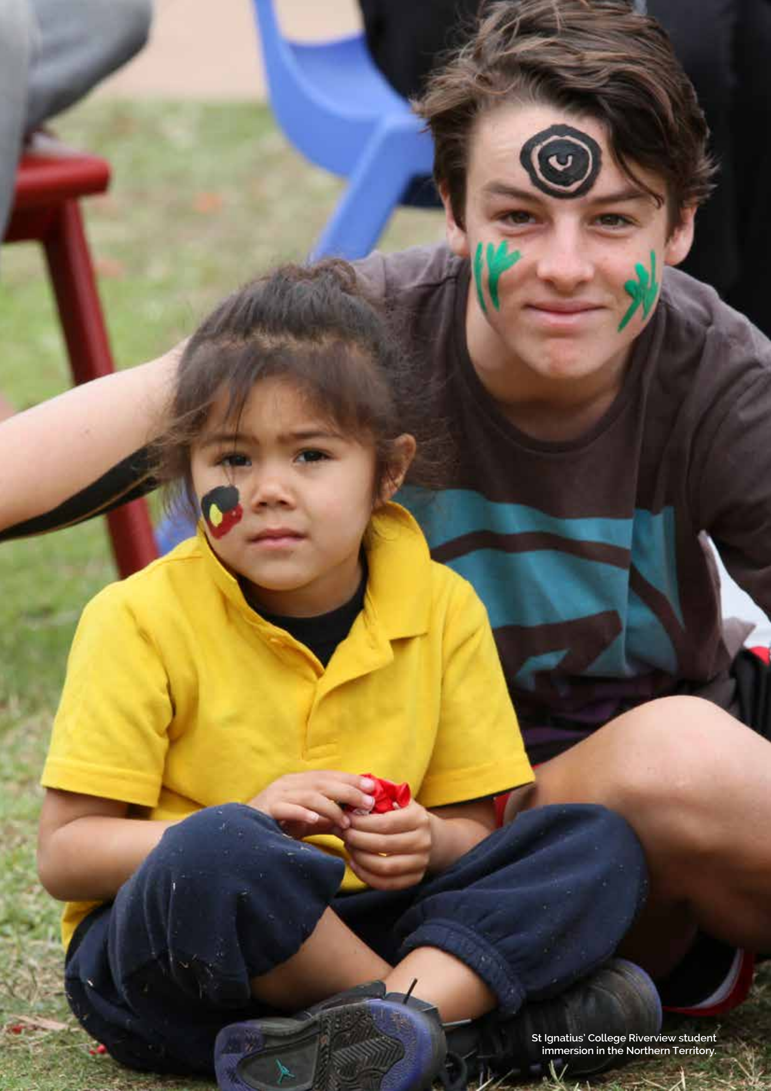
St Ignatius' College Riverview student immersion in the Northern Territory.